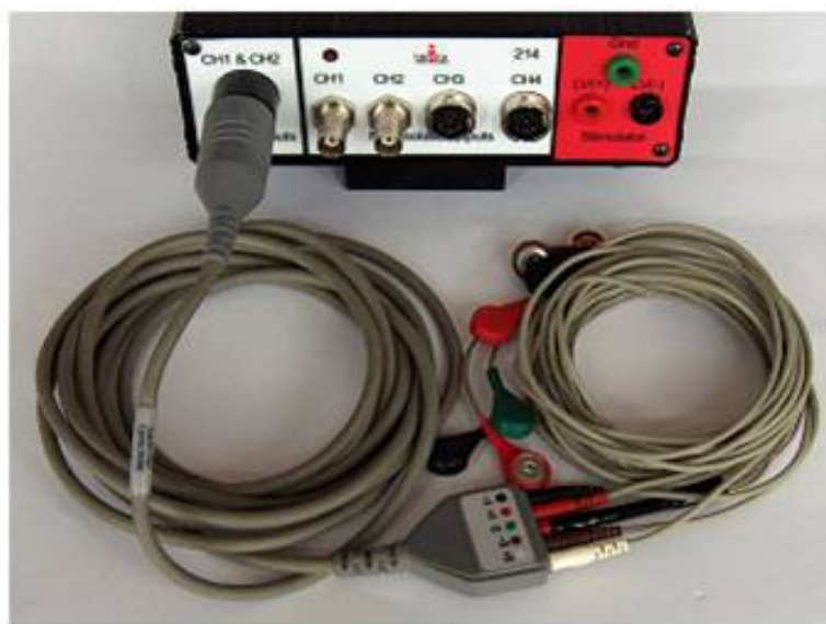
Figure HH-7-S4: C-AAMI-504 cable with C-ECG-IE indifferent electrode cable attached to an IWX/214 for recording a limb and a chest lead ECG.