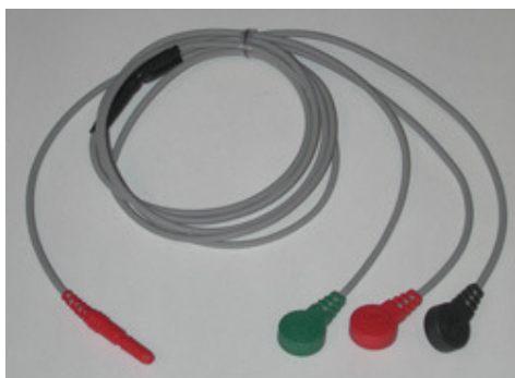
Figure HH-7-S3: C-ECG-IE indifferent electrode cable.