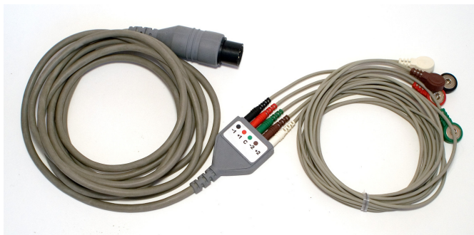
Figure HH-7-S2: C-AAMI-504 cable with five snap leads.